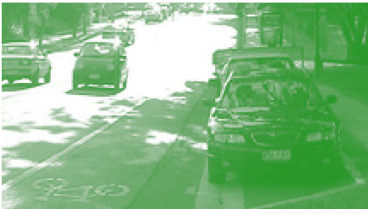
Figure 1: Sylvan Road, Toowong, retrofitted with bicycle lanes and indented parking