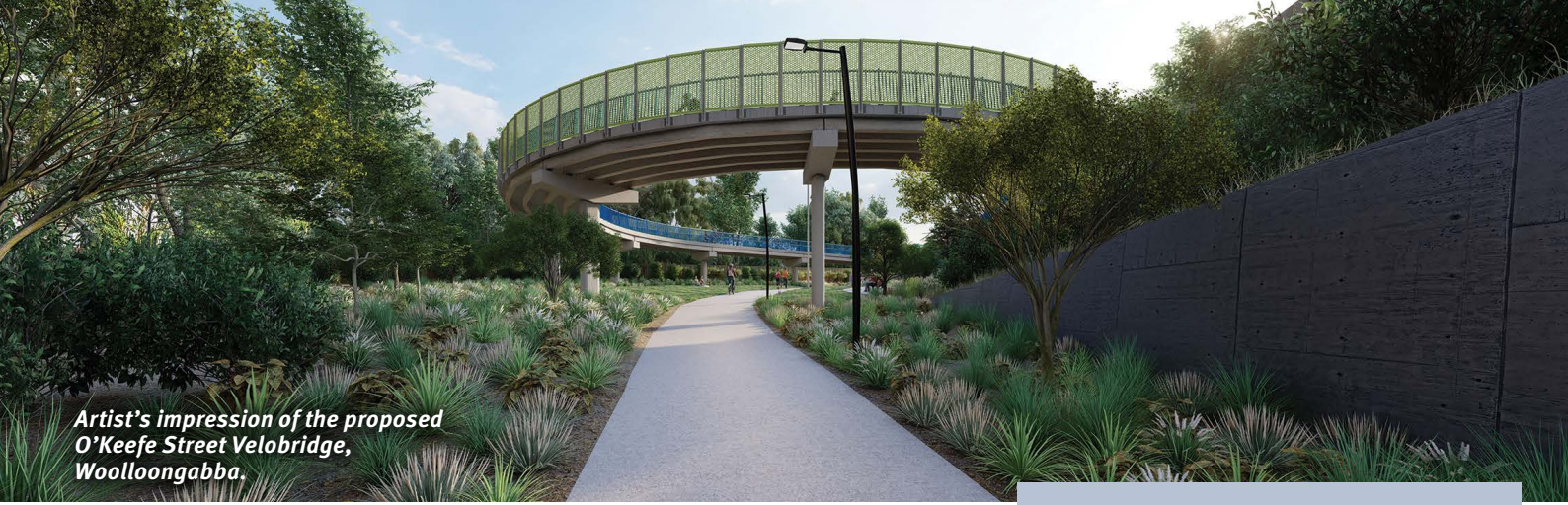
Artist's impression of the proposed O'Keefe Street Velobridge, Woollongabba.