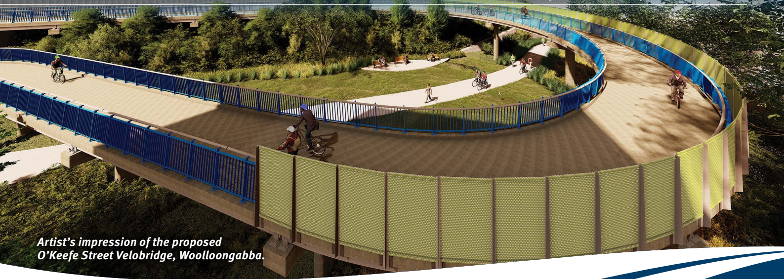
Artist's impression of the proposed O'Keefe Street Velobridge, Woolloongabba.