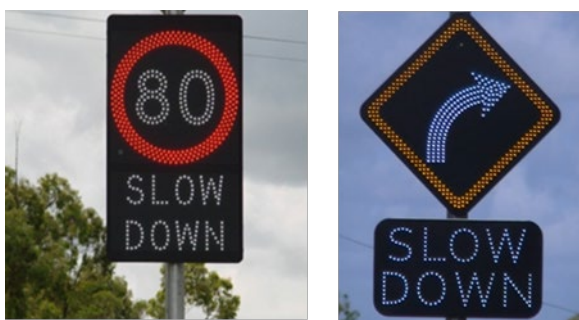
Figure 9.3: Example VAS

As the VAS displays are on a black background, the signs cannot have the same colour display as per the MUTCD. In the case of the speed limit roundels, the signs shall have illuminated white numerals within a red annulus. The 'SLOW DOWN' message is in white. Hazard warning signs (curves, intersections and roundabouts) have an illuminated white symbol within a yellow border and the 'SLOW DOWN' message is in white.