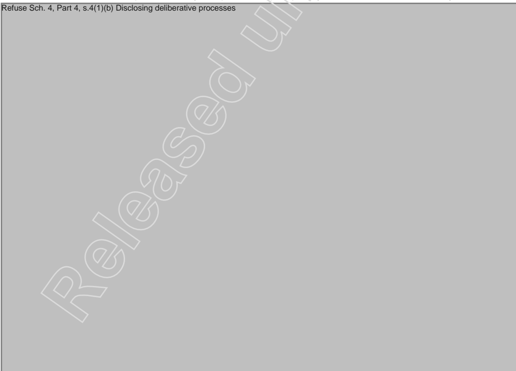
Figure 1: options

Refuse Sch. 4, Part 4, s.4(1)(b) Disclosing deliberative processes